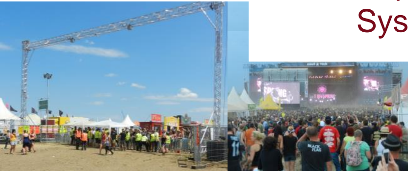
Crowd dynamics Events, airports, stations