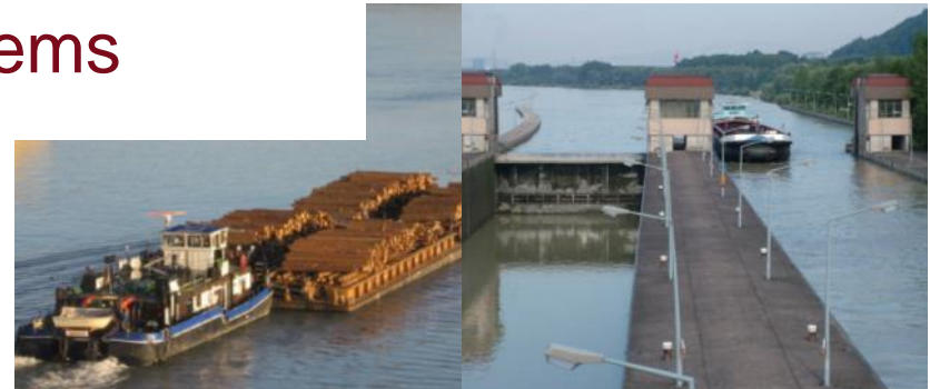
Dynamic route planning Transport logistics and optimization